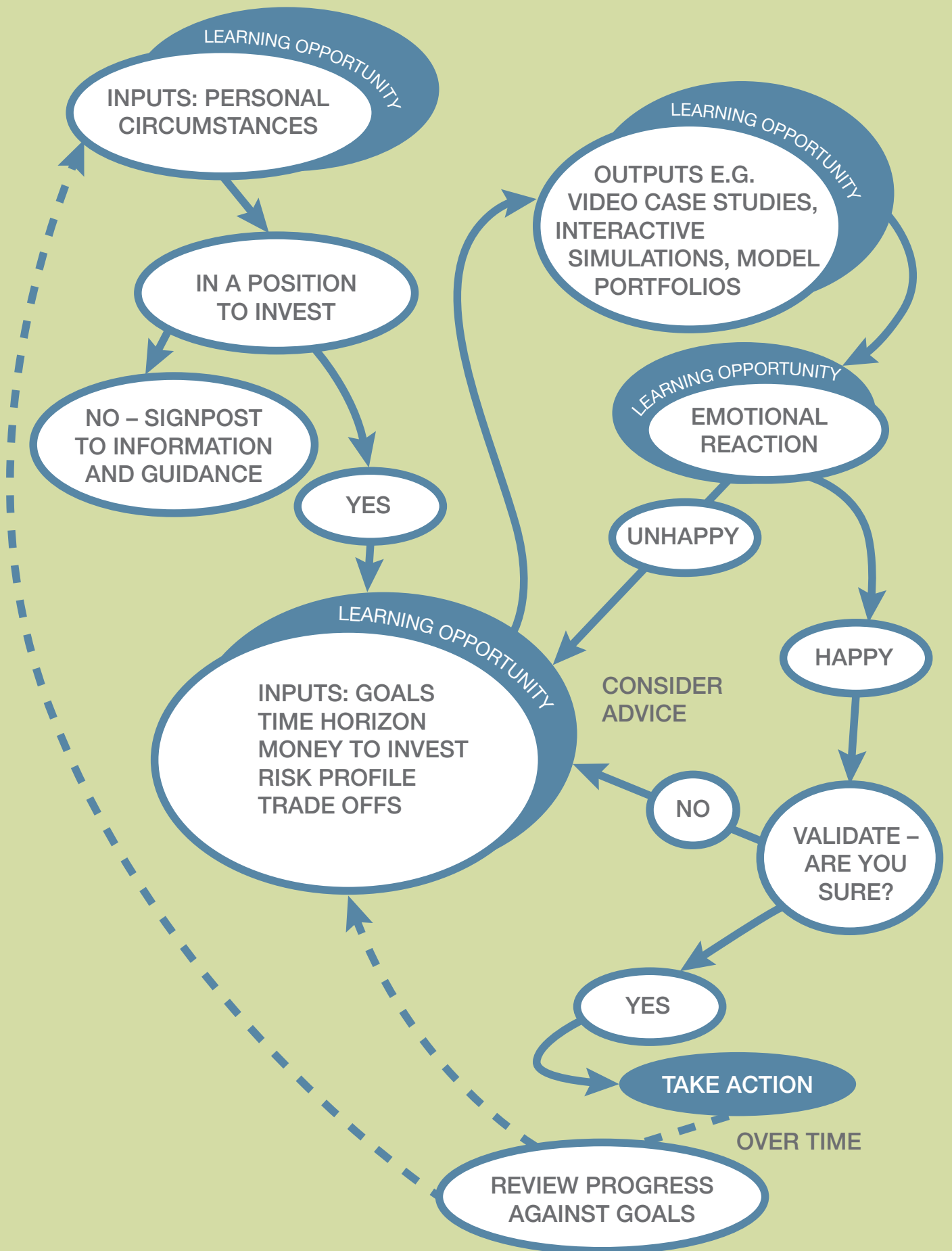
Figure 1: A conceptual model for technology-enabled retail investment decisions